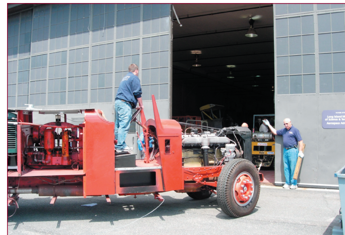
Pushing equipment inside - April 2006