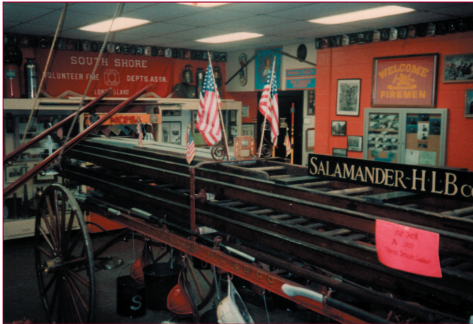
Fire Museum at the Fire Service Academy - July 1988

The Francis X. Pendl Nassau County Firefighters Museum & Education Center