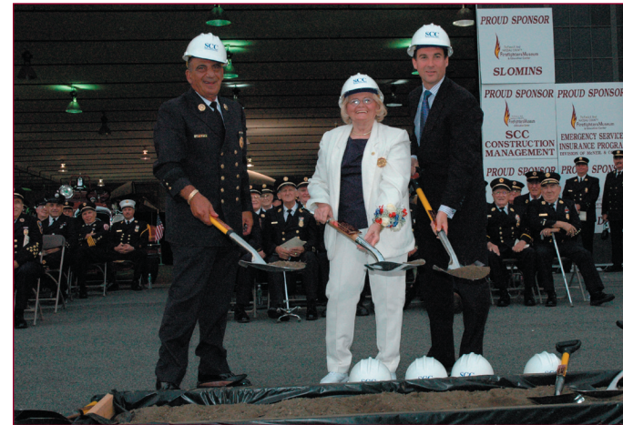
Ground Breaking Ceremony at Museum site - August 2005

Public safety and the education necessary for both young and old, became paramount to him. Through LOVE he was able to move ahead. His twelve children and their wonderful spouses, his grandchildren and I are so indebted to all who made this day possible.