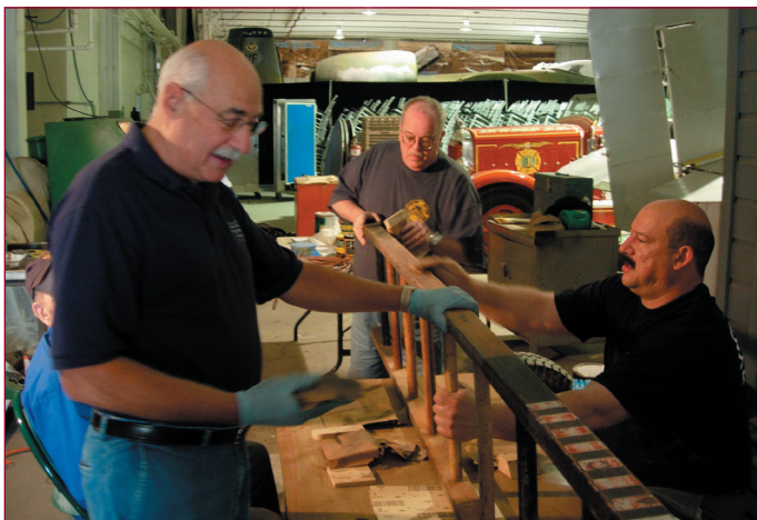
Work Detail inside the Museum