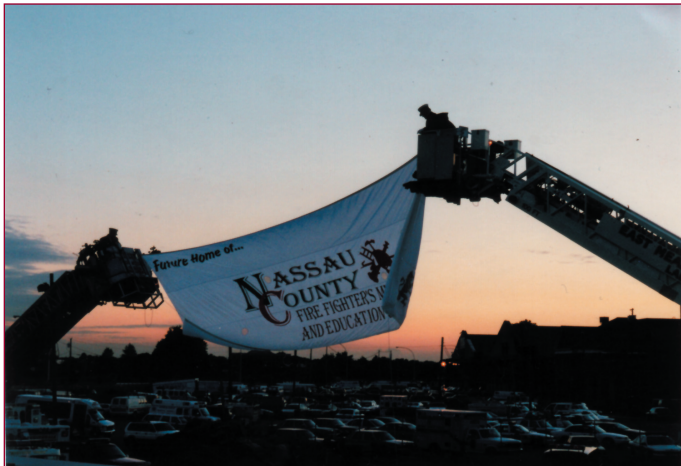
Banner Raising at Museum site - June 1999